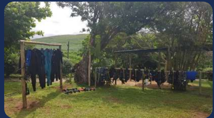
Inside our dive centre main area, tea station, separate gear room and compressor room. Gear wash and dry area