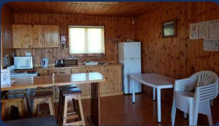
Kitchen equipped with fridge, kettle, toaster, microwave, oven, cutlery, crockery