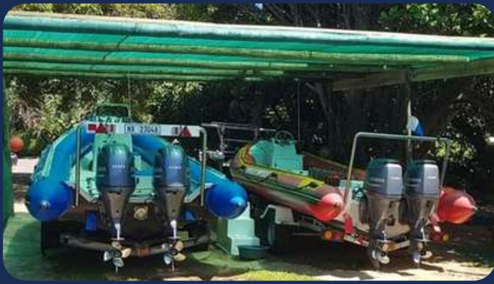
2 x 8m zodiac's with 100HP Yamaha 4 Stroke Motors & tractor – boats are loaded and short drive down to beach